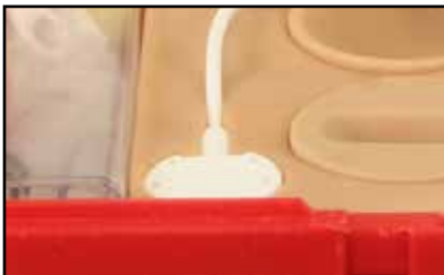
Photo 6 – Correct storage position for port

Should this happen, move the port to the proper storage position. Over the next 72 hours you will see most of the improvement that is possible.